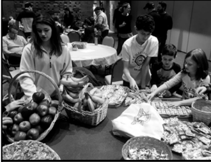
Religious School students making Mishloach Manot for Purim

Our Religious School classes have been busy! In February, we observed Jewish Disabilities Awareness, Acceptance & Inclusion Month (JDAIM) by using a special curriculum developed by the Matan Institute. Matan educates Jewish leaders, educators and communities, empowering them to create learning environments supportive of children with special needs, through training Institutes and consultations across North America. I was blessed to undergo training through Matan in 2016. We welcomed Matan to Columbus for Community Educator Day in 2017, where our teachers had the opportunity to learn with this incredible institution. Let's see what else our classes have been up to this year!